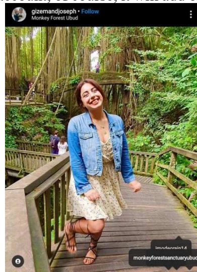
Figure 4: Photo using the Tag Feature

number of followers. With this feature, if a visitor uploads a photo by tagging the Monkey Forest account, of course, it will add or expand the target market.