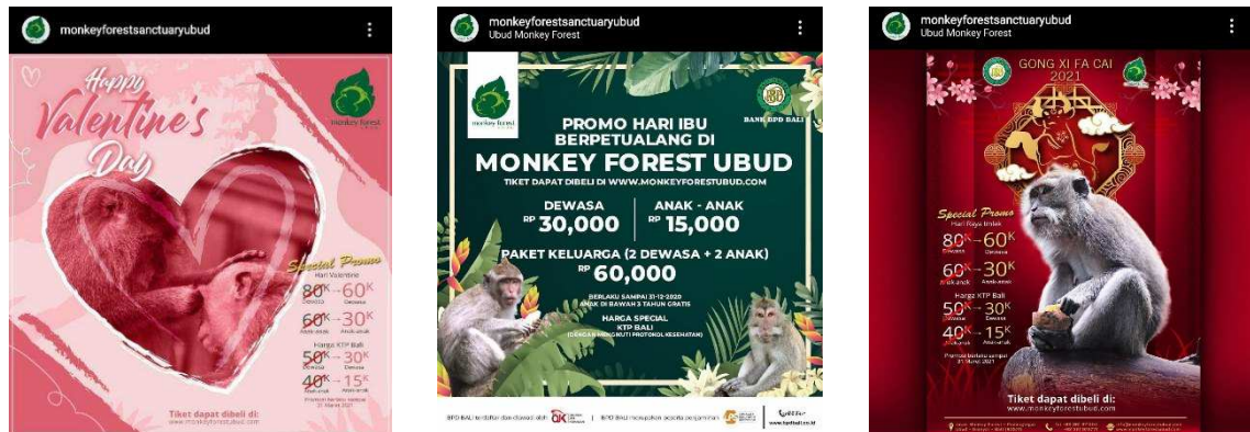
Figure 3: Special Day Offers

In the main use of Instagram, which shares stories through photos and videos, the Instagram account @monkeyforestsanctuaryubud uses this feature to upload photos of monkeys that are unique in their promotional strategy. In addition, on the Instagram feed there are also various promotions such as promotions during Valentine's, Chinese New Year, Mother's Day and many others. In the posting, Monkey Forest also uploaded the packages offered and the guidelines for potential visitors who would come to Monkey Forest.