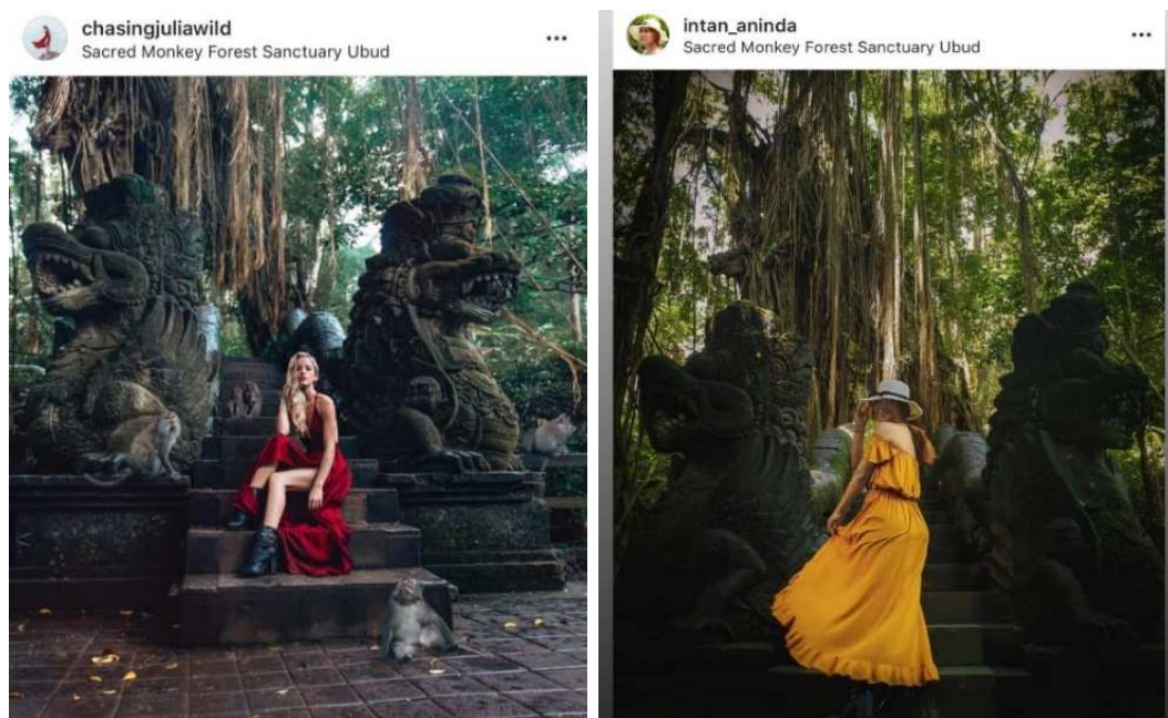
Figure 5: Dragon Bridge Monkey Forest