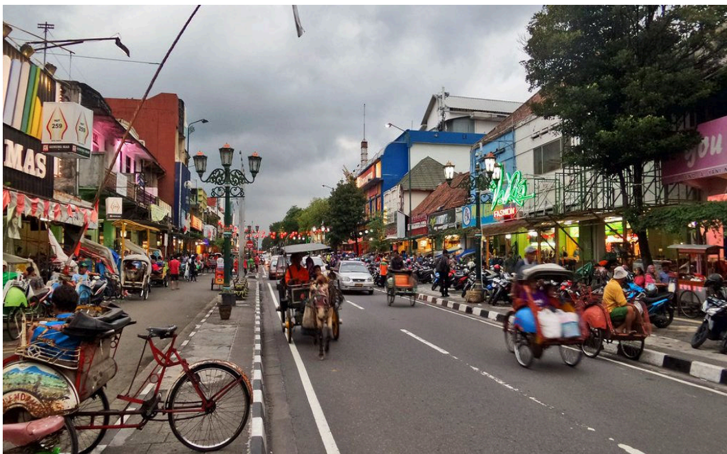
Image: Heritage of Malioboro Yogyakarta, Indonesia

Special regions of Yogyakarta in all districts: Sleman, Bantul, Kuloprogo, Gunung Kidul regencies and the municipality have been able to create the local attractions of their respective interests from the role of investors and tourism activists. Along the coast of Kulonprogo, Bantul and Gunung Kidul districts, they have been able to develop coastal areas with their uniqueness such as mangrove forests, Glagah, Goa Cemara, Baru beach, Samas, Parangtritis, Baron, Kukup, Krakal, Cial beach, Jogan, Gesing, Indrayanti , etc. Sleman Regency with the development of the Merapi area, world landmarks, Stonehenge, Merapi Museum, Sentanu batik museum, Lava tour, Lantern Tourism in Kaliurang and the Municipality of Yogya with the development of the Tugu, Malioboro, Zero Point, and southern square area.