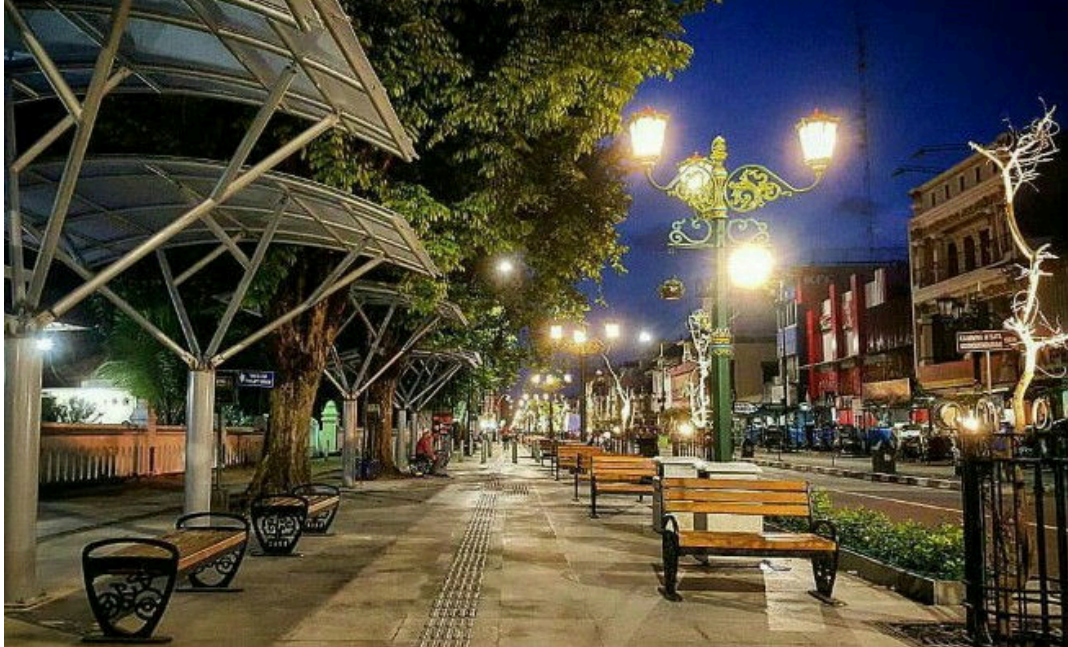
Images: Pedestrian area of Malioboro Yogyakarta, Indonesia

provide benefits and value for the local community to improve their social welfare. Labor intensive is directed to public works, such as rural infrastructure development, environmental sanitation development, reforestation activities, according to the needs of each regional style business.