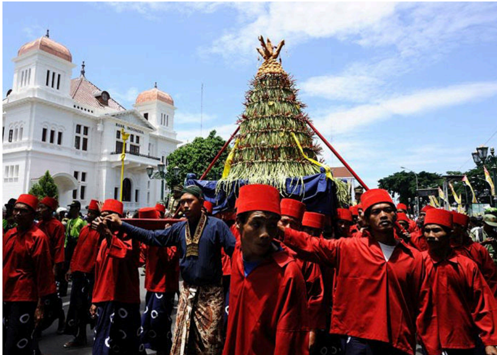
Image: Uniqueness of Grebeg Maulud event in Yogyakarta Indonesia

Javanese culture event is Grebeg Gunung as a special business attraction in Yogyakarta.