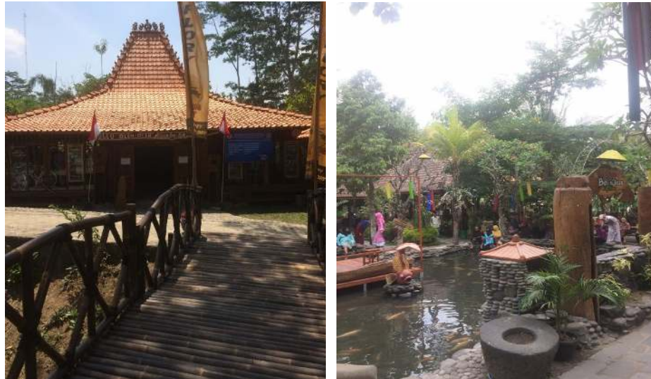
Figure 2. Joglo Souvenirs and Bali nDeso Restaurant