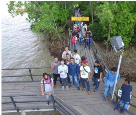
Figure 1 Visitors taking photos using a drone in Mengkapan Mangrove

Not only beneficial to the economy, tourism, especially nature-based ones, also has a positive effect on ecosystem sustainability if it is well and professionally managed. In this case, Hall, et al. (2011) has confirmed that the relationship between tourism and conservation is a mutually beneficial relationship and this has been widely discussed by experts. The current development in Mengkapan Ecotourism Mangrove is also expected to be able to support the efforts of mangrove forest conservation.